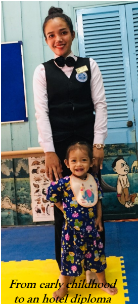
From early childhood to an hotel diploma