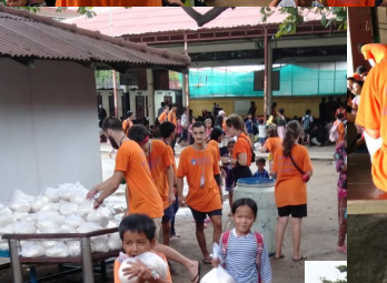
Rice for the family