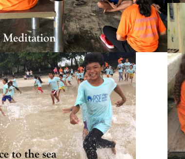
Race to the sea