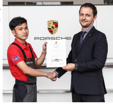
to their hard work and motivation!

Good luck to all three of them as they rise to the challenge due in a large part